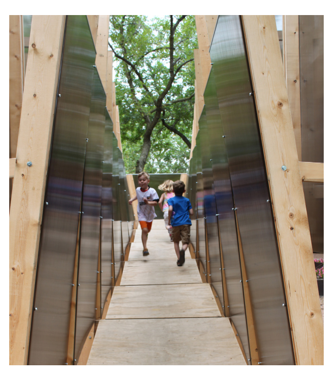
Figure 2: Not only does the scale of the space change when children run along the ramp but the function of Breaking Ground transforms into, what Harriet Senie would call a humanizing element, a playground.

audience for a specific work of public art."<sup>14</sup> Senie's findings included that "[t]he general condition of the site directly affects perception of the art" as well as "what people generally do there."<sup>15</sup> For example, people's interpretation of a work of art was affected by the cleanliness of the location as well as the characters inhabiting the space. Many of the parks with public art that were part of the study included populations of homeless people, which tended to affect interpretation towards the negative or gloomy.<sup>16</sup> Conversely, the functions of an area affected how audiences interacted with works. "Although some people were initially hesitant to talk about public art, they had no problem using it according to their needs or wants as a photo op, street or playground furniture (depending on age)."<sup>17</sup>