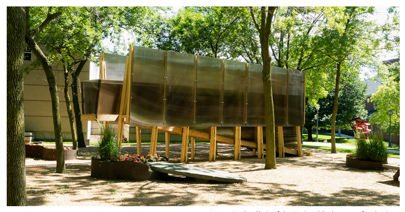
Figure 1: Breaking Ground cuts across the bosque of trees at the Haggerty Museum of Art Sculpture Garden.