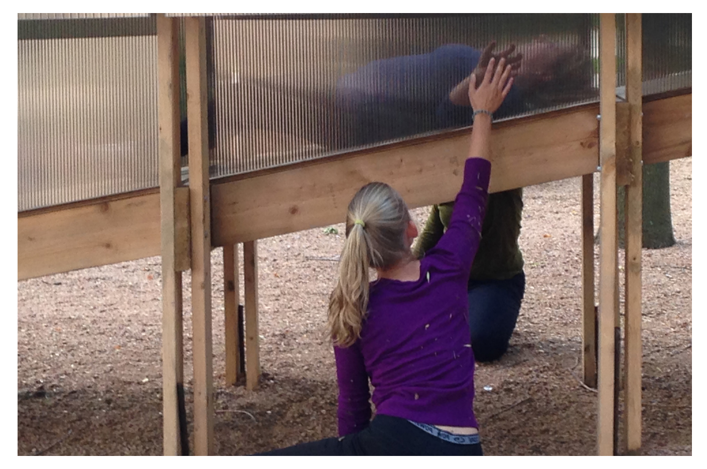
Figure 4: Dancers connect three spaces of the installation at a point of shift in the translucent polycarbonate panels.

In its collaboration with an architectural practice (and then dancers and musicians), the museum expanded its patronage to individuals who may have not shown up for the reception without this linkage to their professional or recreational interests.