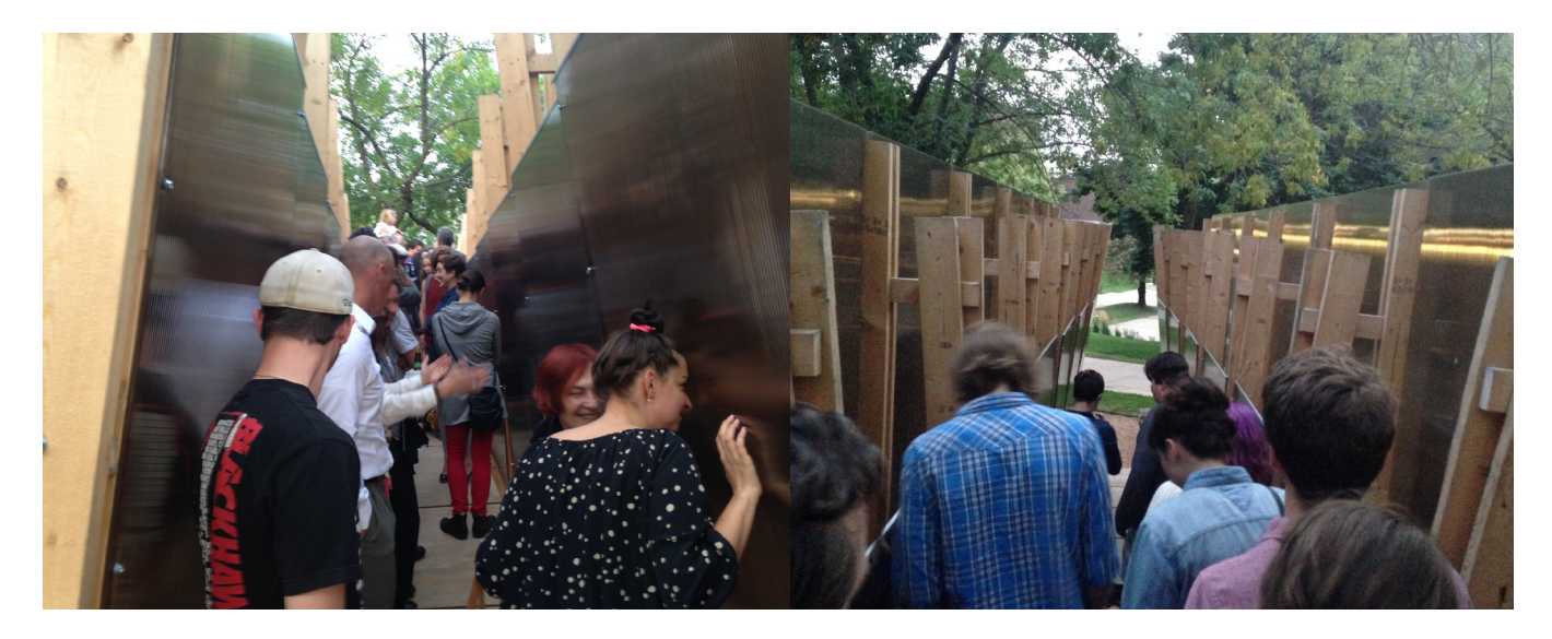
Figure 4: Inside Breaking Ground the audience occupies the position previously held by the performers.

from adjacent buildings including the museum. The space, identified as the museum's sculpture garden, performed mostly as a passageway